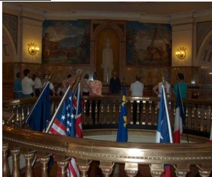
DLC attendees participating in the Tour of the Capitaol